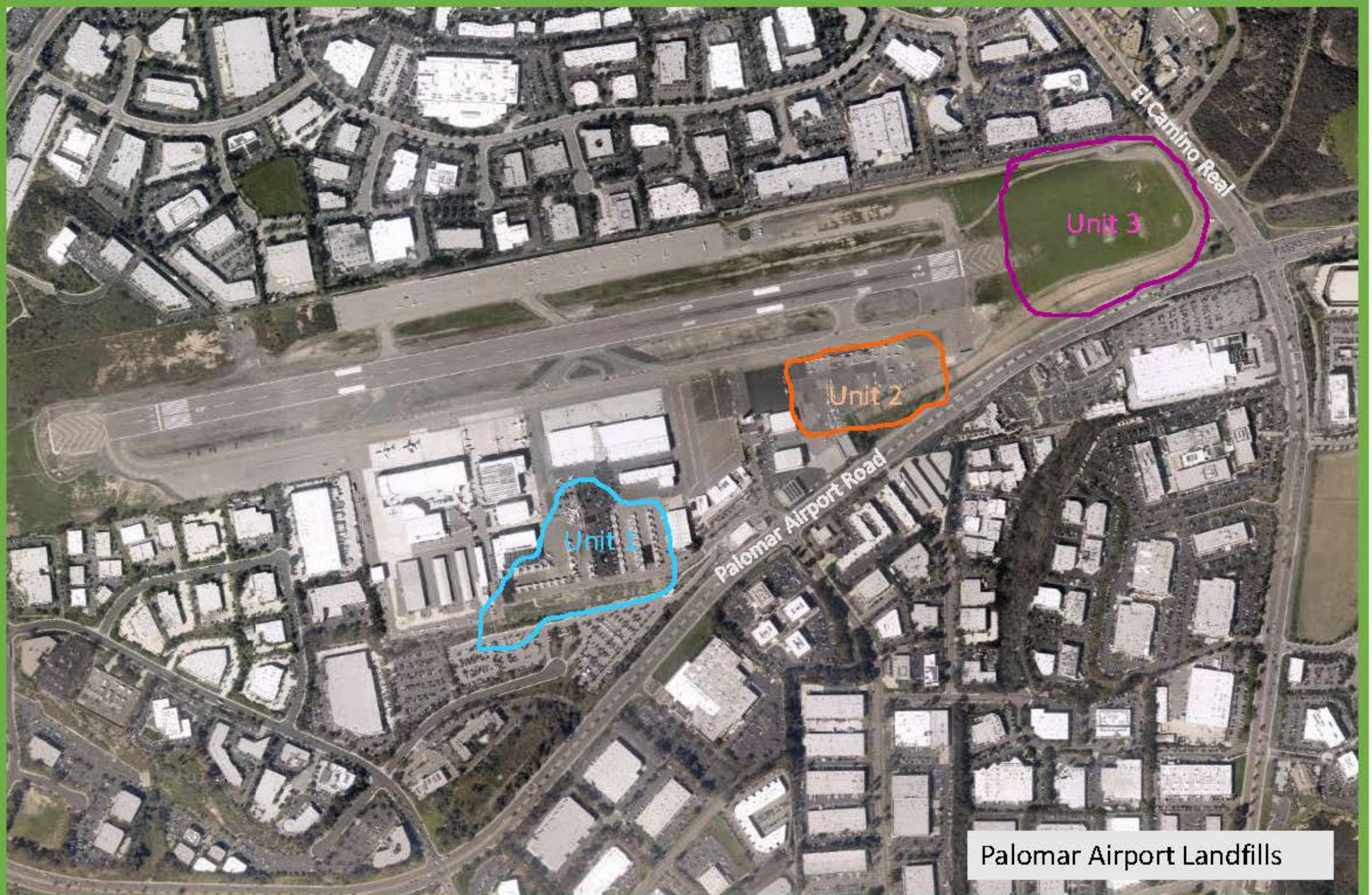
Palomar Airport Landfills